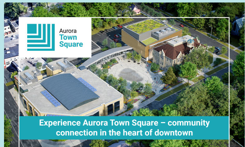
Experience Aurora Town Square – community connection in the heart of downtown

The 2023 Waste and Recycling Calendars have been delivered to households via Canada Post. Calendars can also be picked up at Aurora Town Hall. Digital copies are also available online. To download your copy or to learn more, visit aurora.ca/wasteandrecycling .